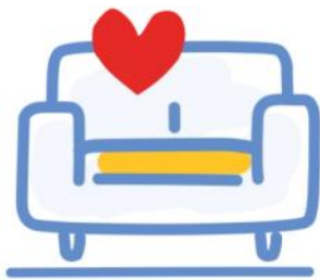
RONALD MCDONALD FAMILY ROOM AT CAROLINE'S CORNER