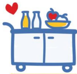
HAPPY WHEELS CART