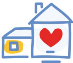
RONALD MCDONALD HOUSE

RMHC of Greater Charlotte serves families of sick or injured children receiving treatment in area medical facilities. RMHC of GC programming is designed to provide comfort and care whether a family needs an overnight stay the Ronald McDonald House, to run a load a laundry in our Family Room, or just grab a quick snack from our Happy Wheels cart.